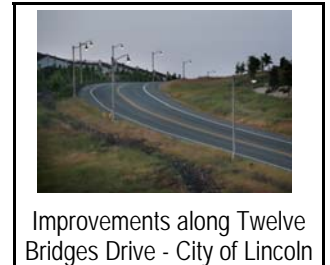
Improvements along Twelve Bridges Drive - City of Lincoln