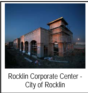
Rocklin Corporate Center - City of Rocklin

TLA Engineering & Planning, Inc. works with developers, architects and public agencies who desire to build communities based upon the client's vision and project goals.